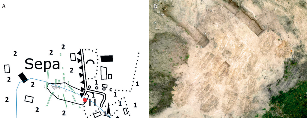
Fig. 3. A. Liu cemetery and its closest vicinity. Gray marks graves, green trenches. 1 – areas of test pits and detector studies, 2 – areas of trenches, test pits and investigations that accompanied excavation work, including detector studies. B. View to the core area of the cemetery. In the upper part of the photo are two trenches, with grave pits in each.

Grave pits, slightly darker than the surrounding sandy soil, were visible at the depth of 15–50 cm beneath the present surface (Figs 3B, 4, 5). The grave pits located on the northern and eastern edge of the cemetery area were covered with a thicker layer of soil, while the earthworks have been carried out there, including both wartime trenches and the present landscaping.