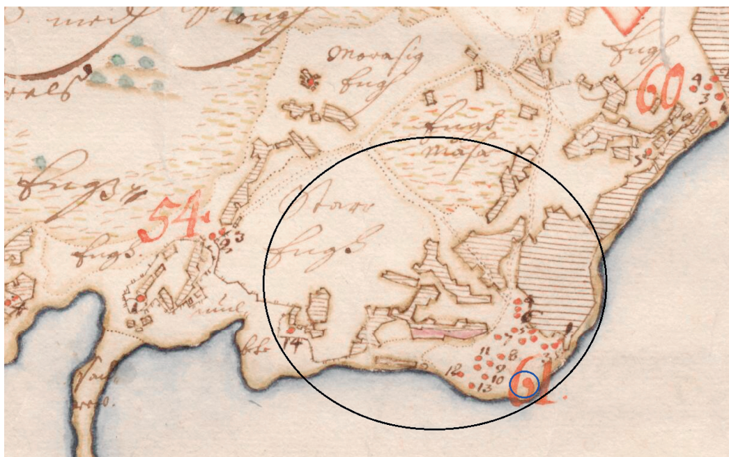
Fig. 2. Liu village on the plan compiled in the second half of the 17th century. Liu village is surrounded by a black line, the location of Liu cemetery is surrounded by a blue line. There were no households in the location of the cemetery.

The chapel is not depicted in the atlas of Mellin, compiled in the late 18th–early 19th century. In addition to the village, it shows the location of an outpost of the Boarder Guard. On the same map, the ruins of a church or a chapel are shown on the lands of Pootsi village, further to the southwest. Was there an abandoned church also in the village of Pootsi, or did the compiler of the map make a mistake in its location, placing it in a different place near the sea? Historically the village of Liu belonged to the Pootsi manor, and this could also be the reason why the chapel might have ended up in the wrong place on the map. As this remains unclear, we should accept that no depiction of Liu cemetery or chapel exists.