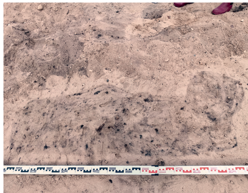
Fig. 5. Grave pit with a distinctive shape in the central part of the cemetery. View from S.

Jn 4. Haulohk kalmistu tuumikalal. Vaade lõunakagust.