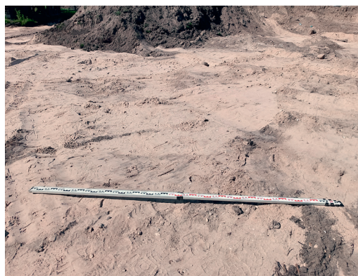
Fig. 4. Grave pit in the core area of the cemetery. View from SSE.

The chapel of Liu has been described as a wooden structure that rested on stones only at its corners. However, considering the defensive trenches dug during the war, these stones may have been pushed aside from their original location, later they may have been used in